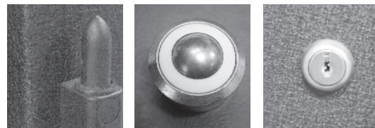
(L to R) Pin for optional front door can be moved to change swing orientation; stainless steel balls help transfer weight smoothly as cabinet swings open; front key lock secures cabinet to backbox while allowing side-by-side installs.

able to left swing orientation. The cabinet shall feature vented side panels, one pair of adjustable mounting rails, and a keyed lock to secure it to the backbox. It shall include side-mounted fixed rails to accommodate optional power strips. The open top shall have knockouts for conduit, knock-outs for BNC antennas, lacing points, and provisions to attach board-mounted accessories. The base shall include stainless steel ball transfers and two access panels to provide an additional 4U of panel space when the front panel is removed. It shall have a load rating of 500 lbs. The back-box with center opening shall be 4.69"D and mount on 16" centers.