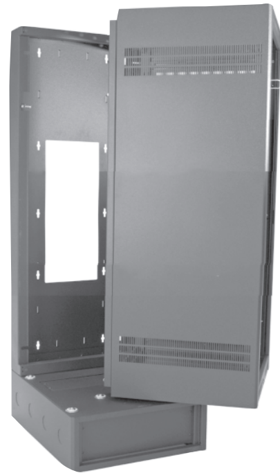
Extra 4U rack space in base — ideal for optional 4U utility drawer.