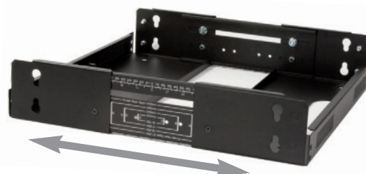
The VARI-RACK's top and base ship pre-assembled except for the depth which is selected during assembly.

The VARI-RACK™ is an innovative design that allows a custom fit on-the-fly with a top/base that can be set to any depth between 21" and 28" and corner post rails with printed marks to guide field cuts if height needs trimming. Made to fit where a standard rack won't, the Vari-Rack is great for use in cabinets, closets or credenzas. Ships unassembled.