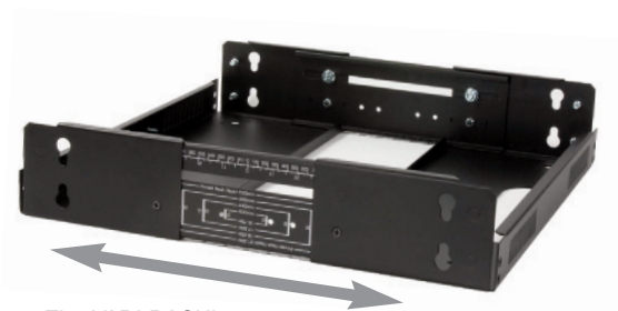
The VARI-RACK's top and base ship pre-assembled except for the depth which is selected during assembly.