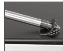
Assembly is fabricated with four restraint tabs for code compliance. Use the tip of a screwdriver to bend the tab out for tie-offs.