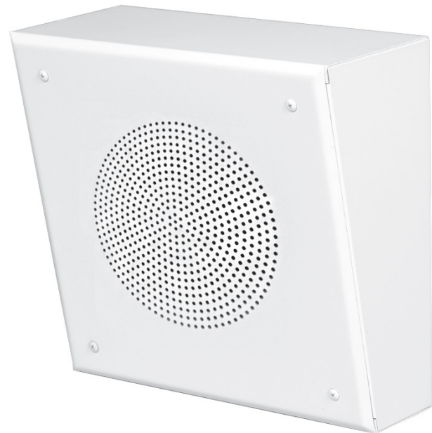
Features an 8" 12W dual cone driver with 70/25V mounted transformer.

The speaker assembly for indoor surface-mount applications shall be AVLELEC Model No. DSL-805-72. It shall include an 8" 12W dual cone driver with 5 oz. magnet, dual voltage 70/25V transformer, white steel grille and backbox with sloped front. The back-box shall measure 11.3"H x 11.5"W x 5.29"D (at top). It shall feature wiremold knockouts on top/bottom and universal mounting hole pattern on rear. The system shall have a frequency re-sponse of 122Hz–7.4kHz (+6dB) and 65Hz–20kHz (+12dB). Average sensitivity shall be 95.1dB. The transformer shall be dual voltage (70/25V) with power taps at 0.25, 0.5, 1, 2, and 5W with color coded leads. The steel backbox and grille shall have a white powder epoxy finish.